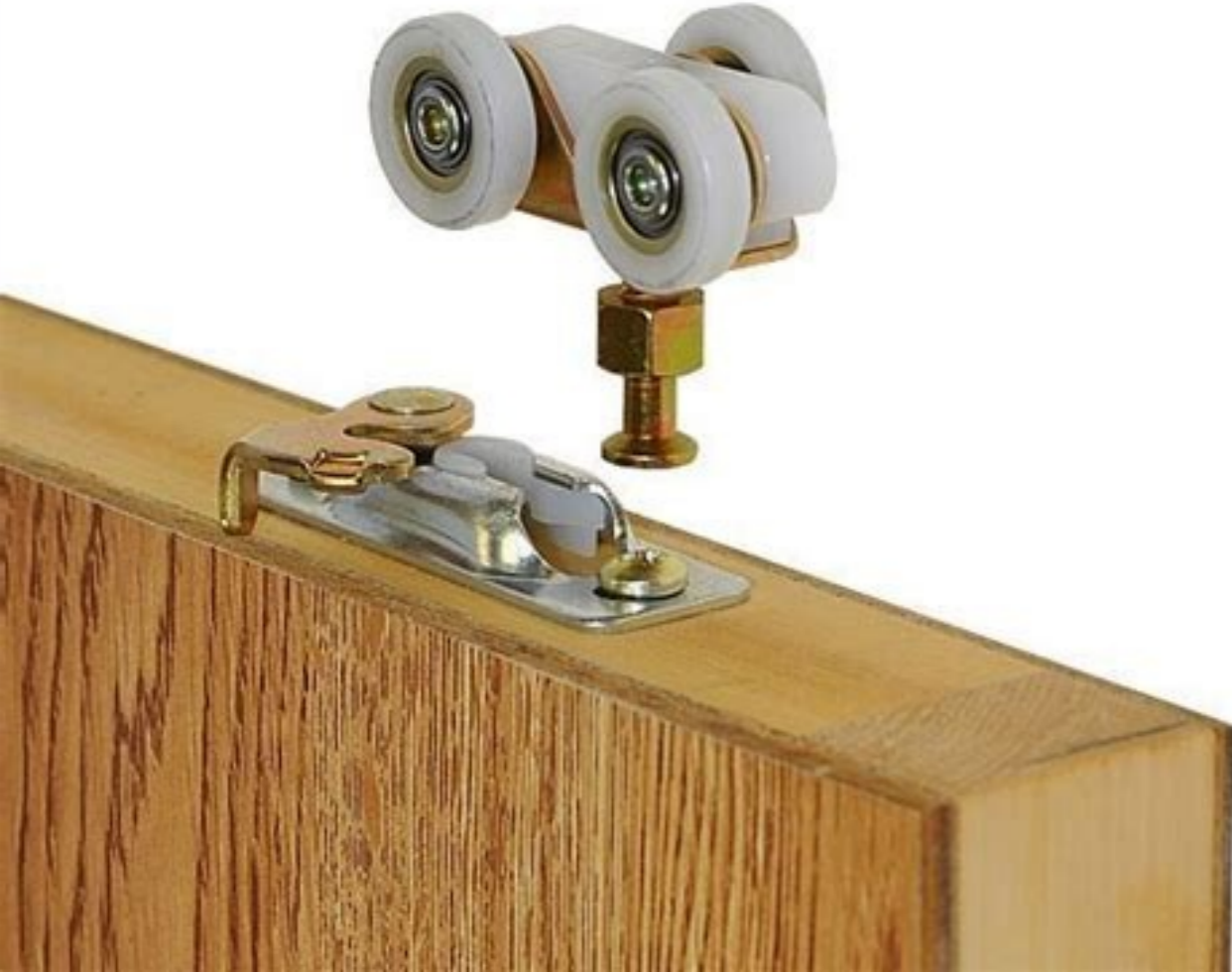
Wall mounted roller sliding barn door guide. Barn door floor guide wall mount home depot. Sliding barn door wall guide. Barn door hardware wall mount door guide. Corinthian barn door guide wall mounted. Home depot barn door wall guide. Renin barn door wall guide. Barn door floor guide wall mount.